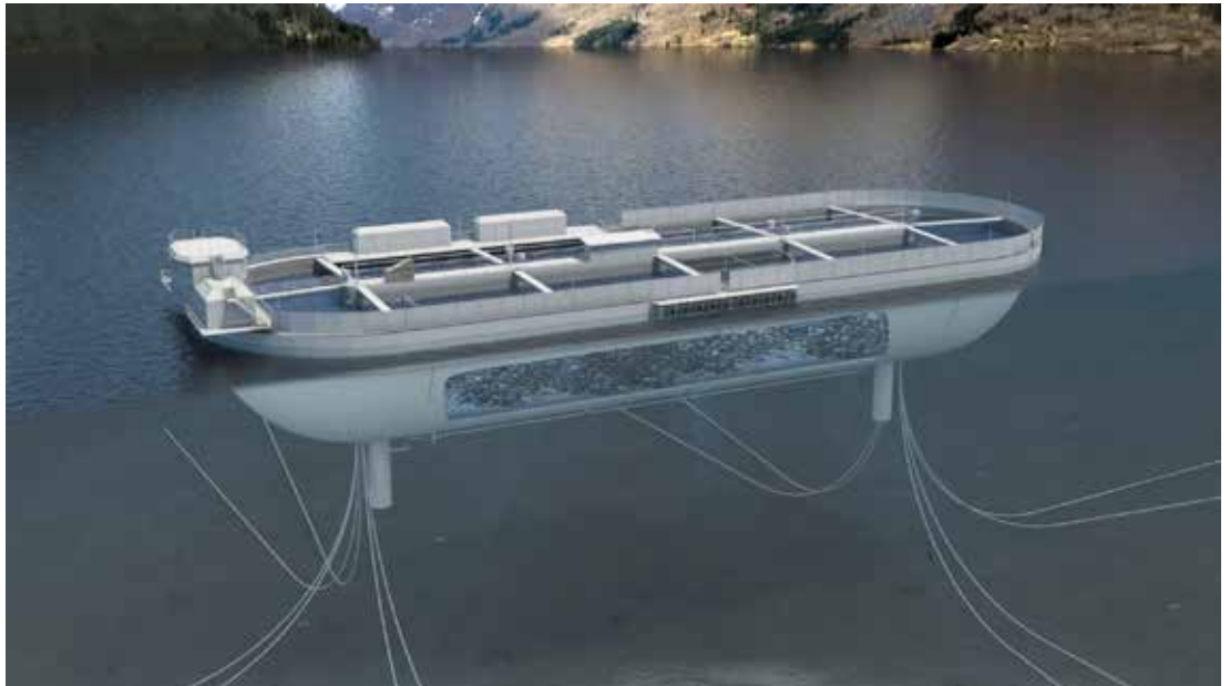
Framo pumping systems for farm fishing have been developed in close cooperation with leading fish farms. The solution is suitable to semi-closed, closed and land-based installations.

The future of farm fishing will likely include both closed and semi-closed farms at sea as well as closed farms on land. All these solutions require pumping large volumes of water. This is where we at Framo want to support you.