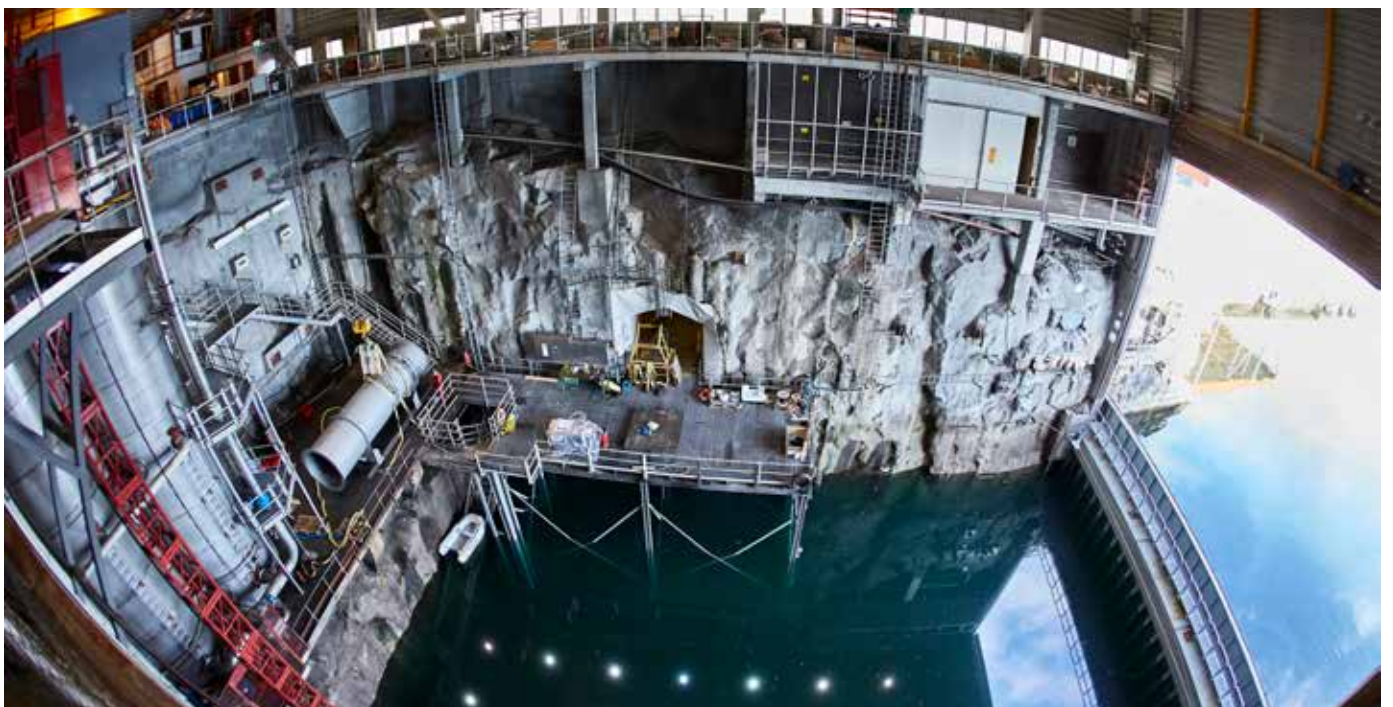
All Framo solutions undergo full-scale testing in our own testing facility.