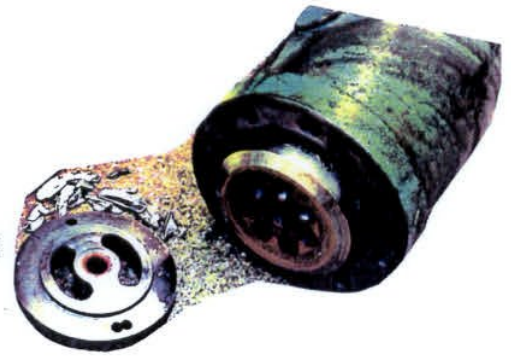
Damaged hydr. pump parts.