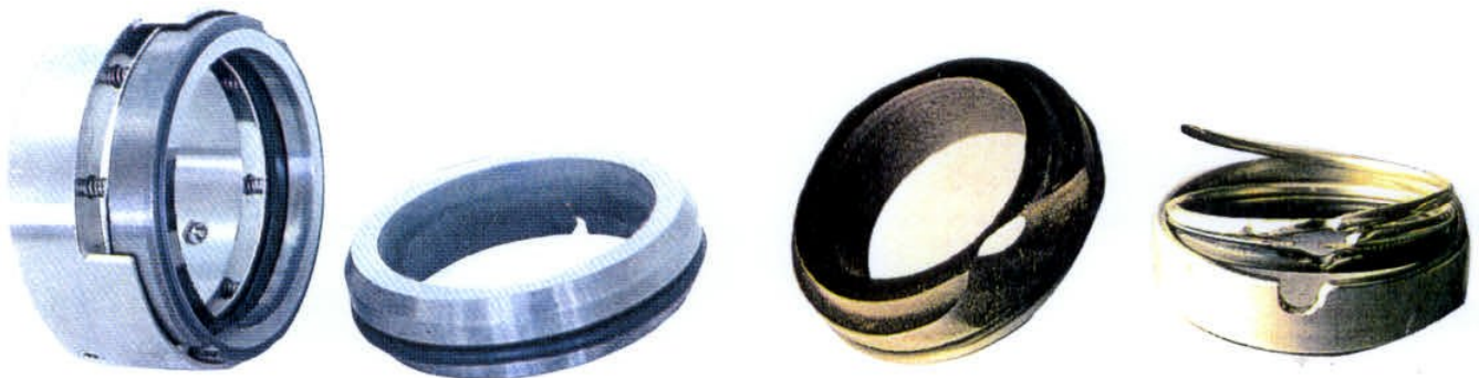
Reconditioned mech. seal inspected and checked before return to customer.

This fact is also taken into consideration during the reconditioning of the mechanical seals. The seals are carefully measured, stationary and rotary part are being lapped or exchanged, o-rings exchanged and measures and tolerances are checked before return to the customer.