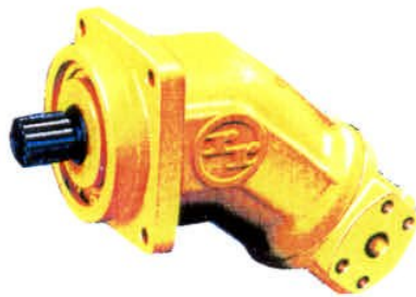
Reconditioned hydr. powerpack pump for return after inspection

At all our offices abroad and in Norway, we have a good stock of selected parts for overhaul of all hydr. pumps and motors fitted on the FRAMO hydr. cargo pumps system. This goes for the old type hydr. pumps/motors, as well as the new type replacement designs (ref. Service Bulletin No. 2).